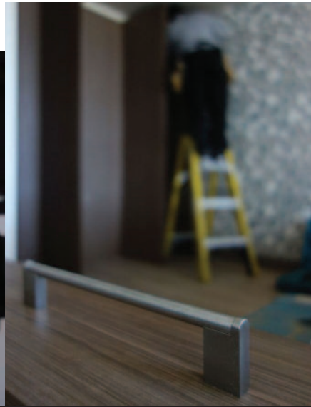
Close up of door by Valet Custom Cabinets & Closets