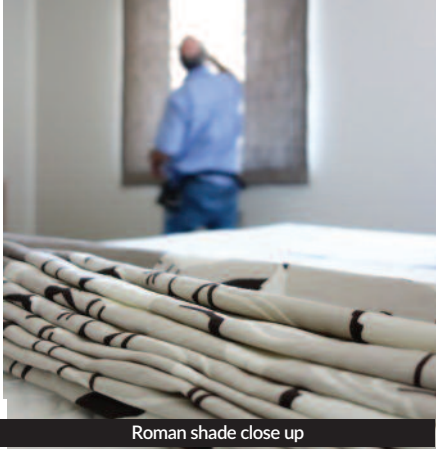
Roman shade close up