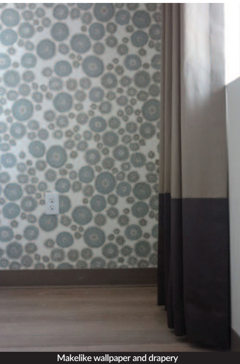
Makelike wallpaper and drapery

Ronald McDonald House at Stanford has for many years helped to fill this need of providing a safe, comfortable and healing place for these families to rest, cook, and take care of the other siblings. Sometimes even the child taking treatments lives there, rather than staying in the hospital. In 1979, the Palo Alto House became the fifth facility in the national Ronald McDonald House system, with 13 rooms. In 1983 they were at almost 100% capacity. By 1984 they were turning people away. In 1992 they expanded to