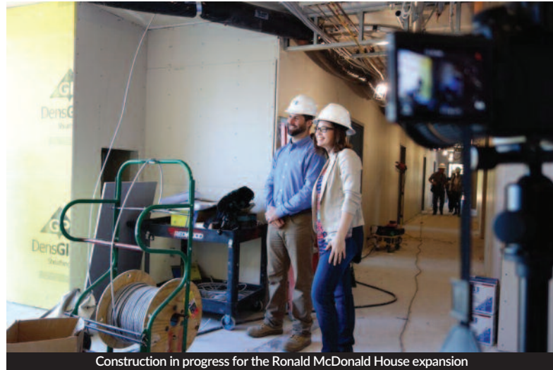
Construction in progress for the Ronald McDonald House expansion

While this was very traumatic and hard on the family, they were fortunate to live in the area, which helped to soften the impact. For many families with children in the hospital, the situation can be even more stressful, with the added burden of pulling children out of school, flying in or sometimes driving for days from other parts of the country, and facing the possibility of paying top price for hotels in Silicon Valley. Some families have even resorted to sleeping in their cars in order to be near their children. The stress of the illness is difficult enough, including managing treatments, anticipating what each new day will bring, and finding the body's "new normal", so adding the logistics and dynamics of the family to the equation creates another challenge altogether.